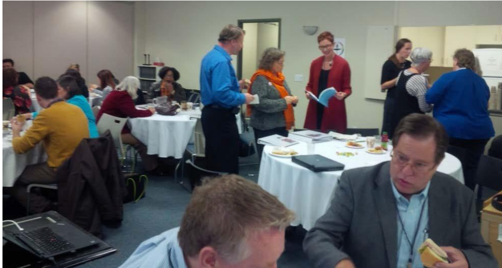
Heartwood House, Ottawa, Ontario – May 2014 NCN Conference

⏏ We have over 25 confirmed applicants and are now likely to house over 30 charities in a larger warehouse space than originally expected. Occupancy is close to 90 % with current applicants. JFC team used three approaches to confirm current interest and obtain tenant applications in the Centre. A focus group was held on September 25 th , an online survey and individual meetings were held in October and November. It is with confidence we can conclude the market demand for shared space in the Jerry Forbes Centre. There is excitement even with those who are waiting until we announce the location before they apply. The NE location is preferred over the Roper Road location and tenants fall into service priorities of: